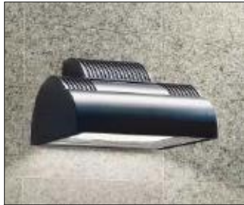
Photo A. Shielded wall pack.