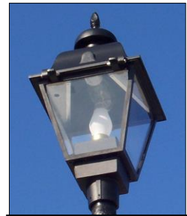
Photo C. The white globe visible to the eye in this post top fixture is decorative; the lamp is in the top of the fixture.