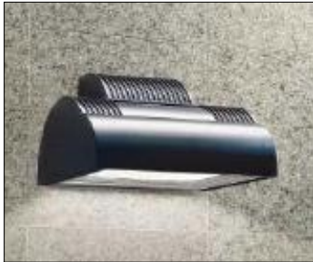
Photo A. Shielded wall pack.

installed, they should have the lamp in the top casing of the fixture so that the light will be directed towards the ground (See Photo C). This will also avoid glare because you don't actually see the lamp. Glare is defined as horizontal light that hinders vision.