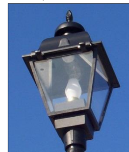
Photo C. The white globe visible to the eye in this post top fixture is decorative; the lamp is in the top of the fixture.