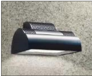
Photo A. Shielded wall pack.