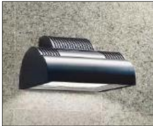
Photo A. Shielded wall pack.