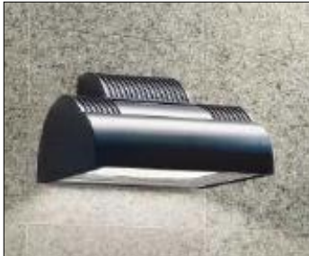
Photo A. Shielded wall pack.

installed, they should have the lamp in the top casing of the fixture so that the light will be directed towards the ground (See Photo C). This will also avoid glare because you don't actually see the lamp. Glare is defined as horizontal light that hinders vision.