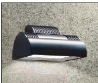
Photo A. Shielded wall pack.