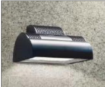
Photo A. Shielded wall pack.

towards the ground (See Photo C). This will also avoid glare because you don't actually see the lamp. Glare is defined as horizontal light that hinders vision.