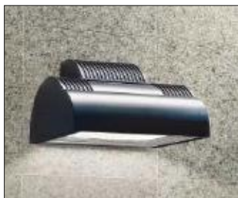
Photo A. Shielded wall pack.