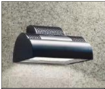
Photo A. Shielded wall pack.