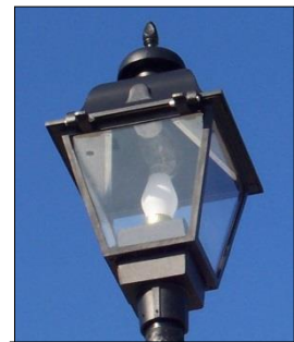
Photo C. The white globe visible to the eye in this post top fixture is decorative; the lamp is in the top of the fixture.