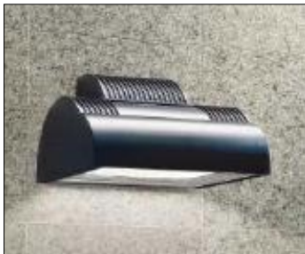
Photo A. Shielded wall pack.