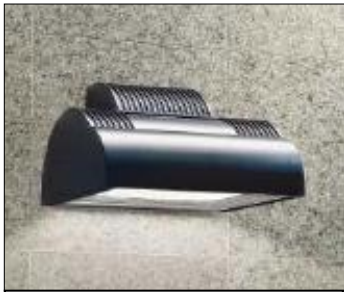
Photo A. Shielded wall pack.

installed, they should have the lamp in the top casing of the fixture so that the light will be directed towards the ground (See Photo C). This will also avoid glare because you don't actually see the lamp. Glare is defined as horizontal light that hinders vision.