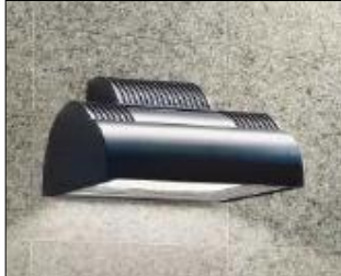
Photo A. Shielded wall pack.