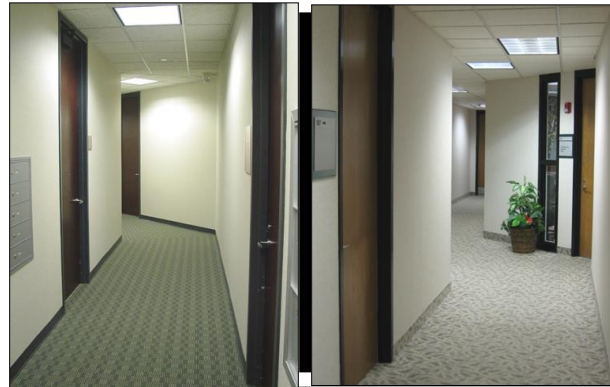
Photo E. The corridor layout can impact lines of sight, limiting and/or maximizing visibility down a hall. Example to the right offers visibility.

The Henrico Police Division supports and implements Crime Prevention Through Environmental Design (CPTED), which is the theory that the proper design and effective use of the built environment can lead to a reduction in the incidence and fear of crime and an improvement in the quality of life.