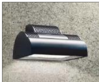
Photo A. Shielded wall pack.