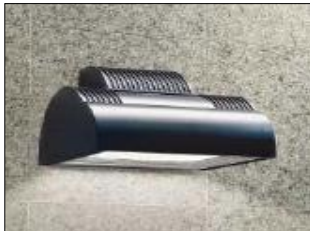
Photo A. Shielded wall pack.