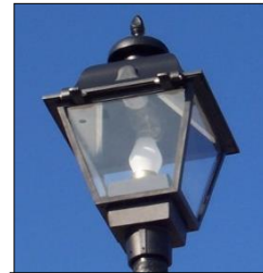
Photo C. The white globe visible to the eye in this post top fixture is decorative; the lamp is in the top of the fixture.