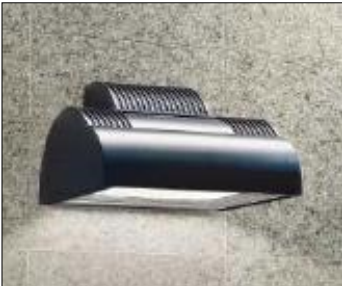
Photo A. Shielded wall pack.