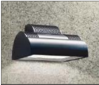
Photo A. Shielded wall pack.

they should have the lamp in the top casing of the fixture so that the light will be directed towards the ground (See Photo C). This will also avoid glare because you don't actually see the lamp. Glare is defined as horizontal light that hinders vision.