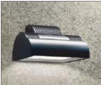
Photo A. Shielded wall pack.