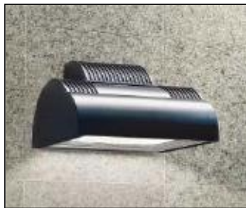
Photo A. Shielded wall pack.