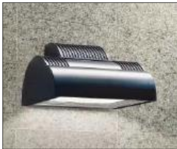
Photo B. Shielded wall pack.