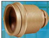
Photo A. Example of a security peephole and a detail of the views it can provide.