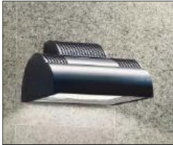
Photo B. Shielded wall pack.

evenness of the distribution of light on the surface(s)”...which “aids security perception, while reducing the necessity for eye adjustment...” IESNA G-1-03, 5.4.