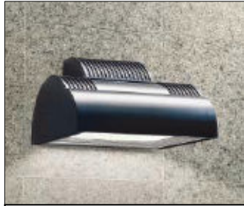
Photo A. Shielded wall pack.