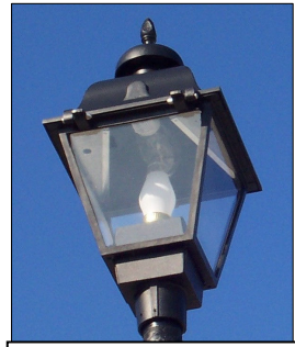
Photo C. The white globe visible to the eye in this post top fixture is decorative; the lamp is in the top of the fixture.