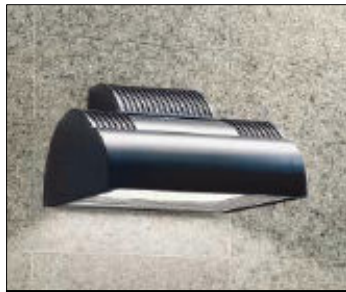
Photo A. Shielded wall pack.